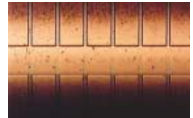
After Using Clean Start You can see that Clean Start ™ has removed the debris so it cannot build up, maintaining optimum print quality