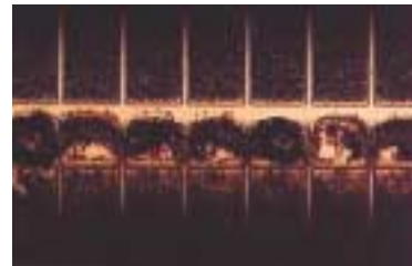
Permanent Buildup Over time, the residue becomes permanent and can result in flaws in the print image.